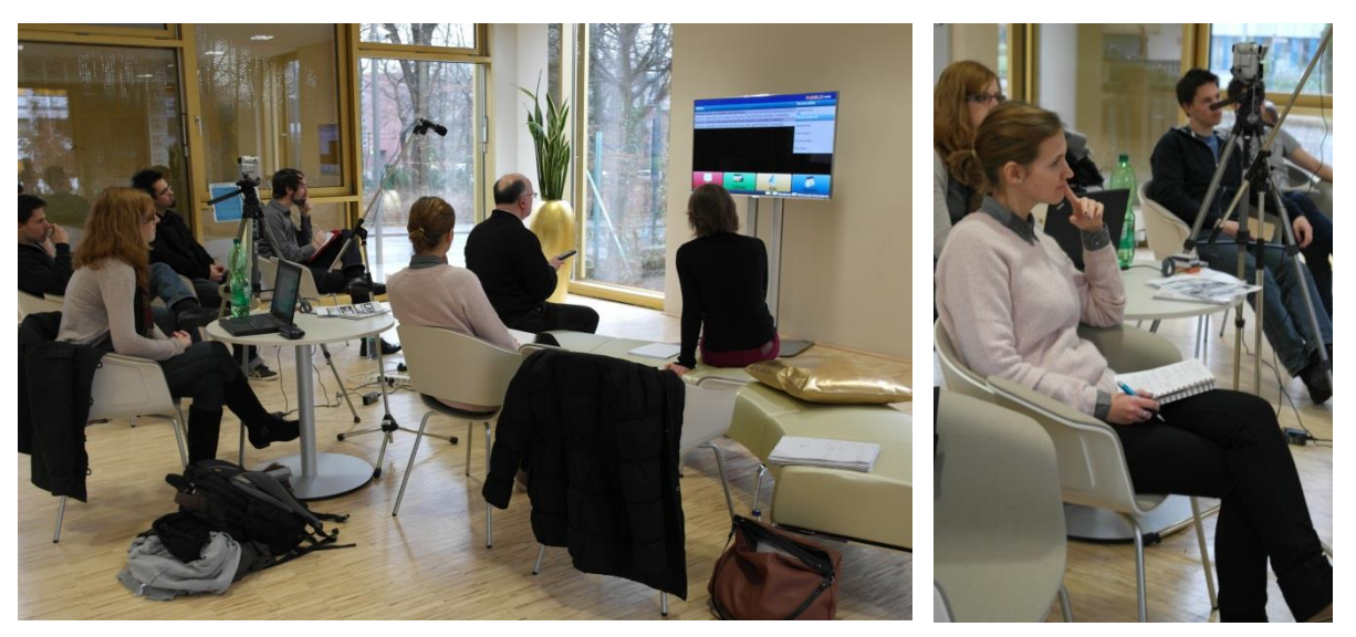
Figure 11 - Expert evaluation in the inHaus

During the evaluation process, nine experts from UDE and IMS reviewed the user interface of the application (one person belonging to the target group). Two of the experts had the possibility to interact with the platform simulating a use situation and inspecting all elements of the application. In this context, the think-aloud-protocol-method (Lewis, 1982) was applied which means that the evaluating person has to say whatever he is looking at, thinking, doing or feeling while going through the platform. This helps identifying problems, misunderstandings etc.