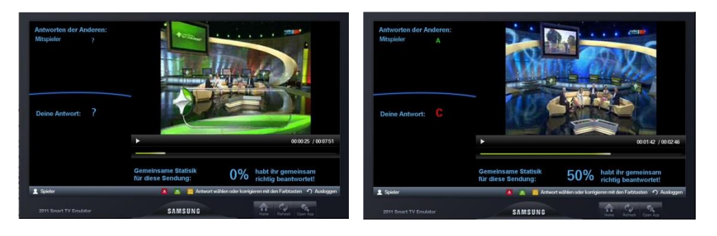
Figure 3 – Interface of Gameinsam, question active and solution

As described in D6.1, "Gameinsam" (Herrmanny et al., 2012) is a widget for the Samsung Smart TV, developed by the researchers of UDE. It offers playful remote interaction among family members and peers which refers to the current TV program, e.g. a quiz show, as part of the playful interaction. The application offers the opportunity of "shared shoutability" (shoutability = the need to e.g. answer questions (aloud) while watching quiz shows), allowing each participant to watch the program at home and share his or her guessed answer using the standard remote control. The four coloured buttons of the remote control represent the three possible choices and a question mark, which may be used for signalising the other player(s) that one doesn't know the correct answer. The information which family members do watch the same program and which answers they choose is displayed in a buddy list. Players can correct their answers all the time as long as the question is active. This allows them to react to the answers of the co-players as they play together. Family members commonly achieve joint high scores offering a collaborative playful interaction. When the solution of a question is given in the program, the question is set inactive, the correct answers are coloured green, the others red and the family score is updated. When there is a new question in the TV program, the interaction is set on active again, so that the users can make their input.