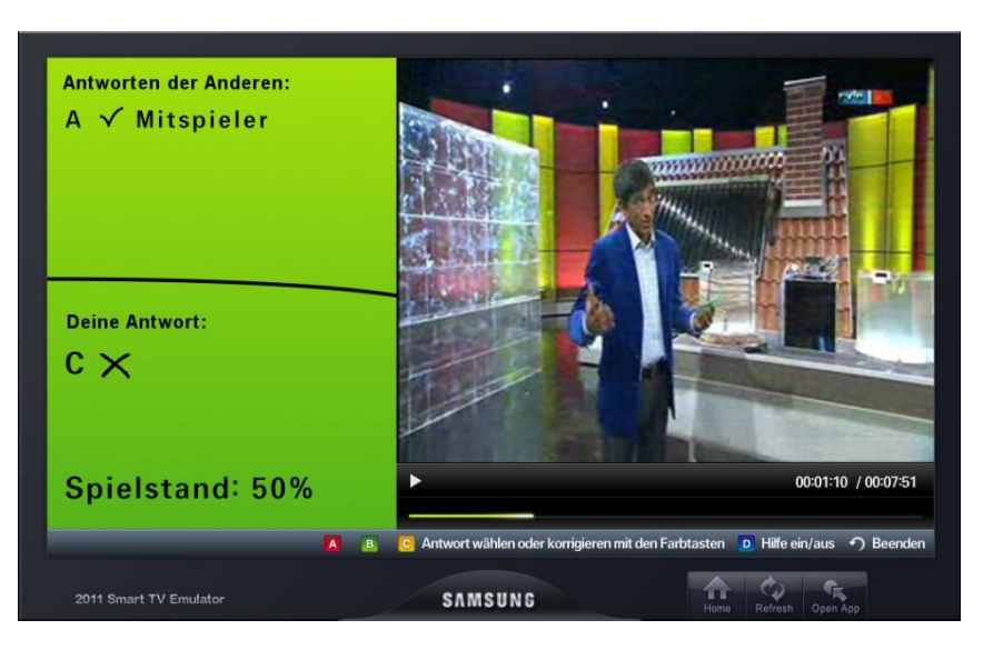
Figure 4 – Re-designed Interface of Gameinsam

In order to optimize the application for the special needs of seniors, a heuristic evaluation based on Nielsen's Usability Heuristics (Nielsen, 2005) and the Style guide for the design of interactive television services for elderly viewers (Carmichael, 1999) was performed. It identified some potential for improvement with respect to an older target group. Based on this, a re-design has been made by the researchers of UDE which included issues like the reduction of the cognitive load by reducing the number of elements, integrating a help menu, replacing some of the wordings with respect to the language of elderly, changing colour and contrast, optimizing the arrangement of the elements, integrating new feedback icons etc.