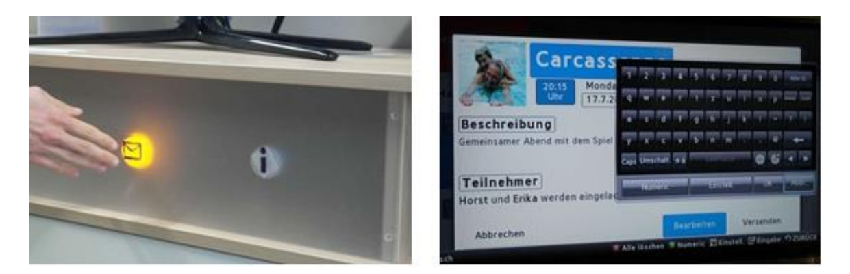
Figure 2: The interaction with sensors to confirm an invitation and a screen cast showing the "sending an invitation for a game night" dialogue.

Subsequently, a focus group session was started with all participants and the experimenters. To allow all participants to join in the discussion intensively, we divided the participants in two groups ( N_{Group1} = 8, N_{Group2} = 7). For the discussion phase, we prepared different questions investigating how the elderly experienced the interaction with the sensor applications and getting an impression of advantages, disadvantages and suggestions for improvement.