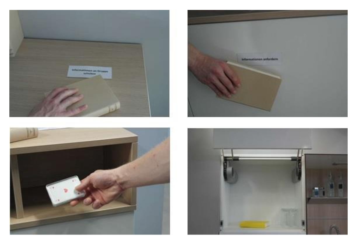
Figure 1: The scenarios "information about a book", "recommend a book", "invite to a game night" and "invite to coffee and cake".

During the interaction of the participants, one of the investigators triggered prepared actions via tablet input for simulating the interaction with a friend of the buddy list on the TV. In this way, several interaction patterns with the platform could be simulated, like answering an incoming invitation, sending invitations or recommendations, etc.