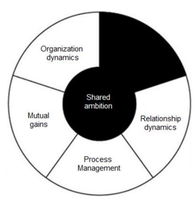
Figure 1. Conditions for inter-organizational collaboration (Kaats & Opheij, 2014).