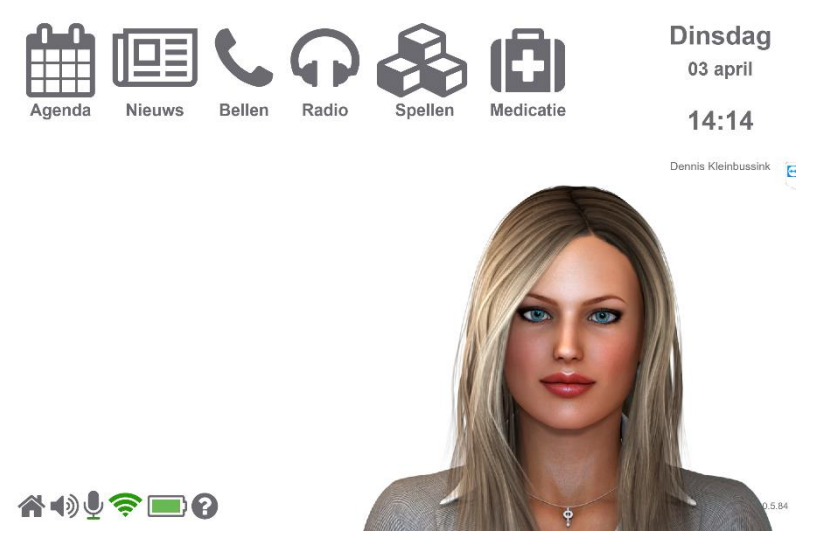
Figure 1: Start Screen Anne

To make sure working with Anne is easy and feels natural the software is built with a recognizable and simple design, see figure 1. The start screen gives a clear overview over all the different functionalities and is built with ease of use in mind.