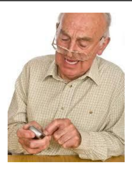
Mobile phones can be difficult to use.

Consistent findings from this research confirmed that older people found smart phones to be fiddly, frustrating and difficult to hold. As such many had abandoned them in favour of mobile phones which simply enabled calls and texts. Many had bought phones as an emergency device and rarely bothered with texts or even charging them up. This indicates the low esteem the users had for these devices even though they were acknowledged as potentially important in a crisis (Zhou, 2013). This is important for small businesses and employers to understand that SMS texts are more likely to be ignored and so important information should not be relayed using this mode of communication.