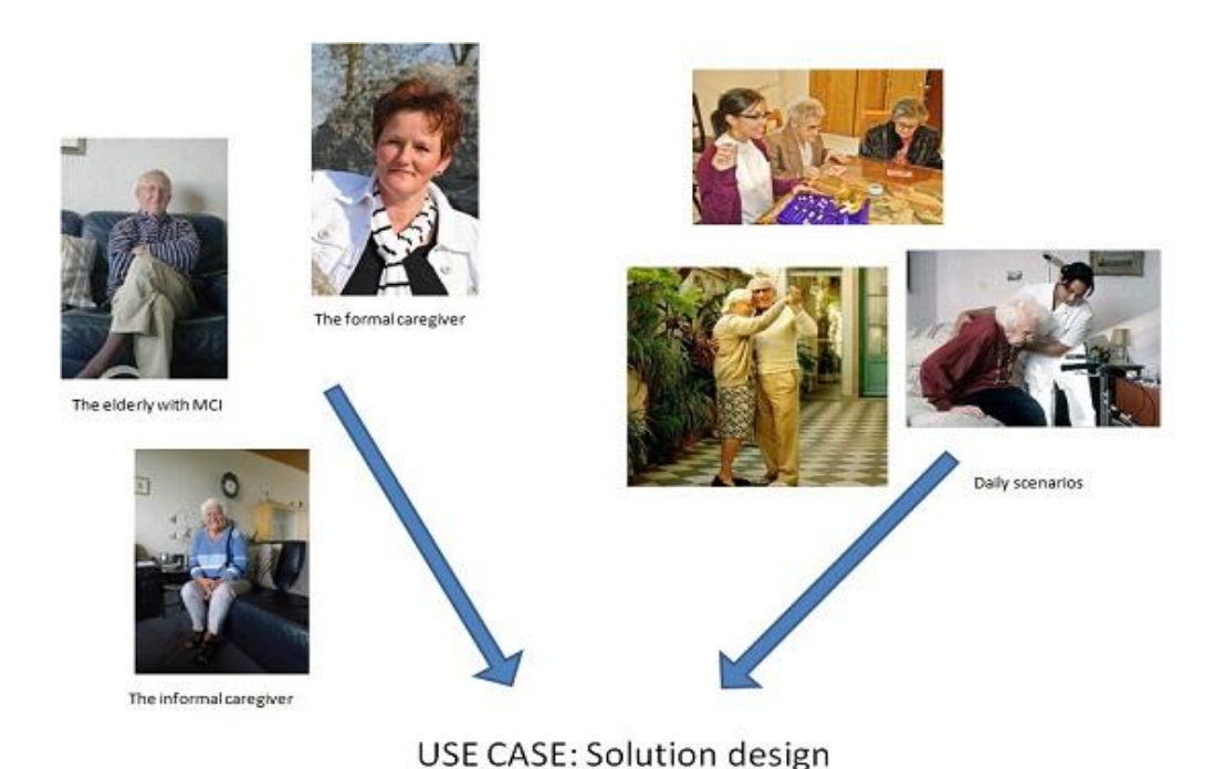
Figure 2.- MyGuardian Use Case creation

Once we have the critical design information, we have added few personal details in order to adapt use cases to the real life. To add this information we have used the interview details too.