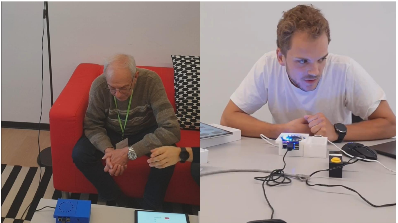
FIGURE 2 THE VIZIER VIDEO