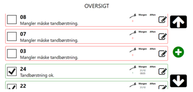
Figure 3: The CARIOT Triage Citizen Overview Screen. The original Danish text translates into English as follows: "Oversigt" is "Overview", and "Mangler måske tandbørstning" is "May need toothbrushing", and "Tandbørstning ok" is "Toothbrushing is OK". In the columns to the right, "Morgen" is "Morning", and

"Aften" is "Evening". Here, citizens' names are shown anonymised (as 03, 07, 08, 22, 24) and their current brushing actions are shown. Red means no brushing done today, and green means brushing was performed as prescribed by the dentist. This screen is placed at the caregiver's office.