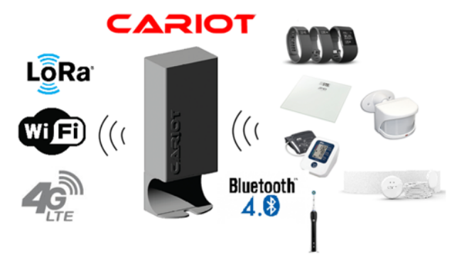
Figure 1: The CARIOT homecare sensing platform (center of the image) communicates with an Oral-B electrical toothbrush and sends the data via a range of different communication protocol standards, Lora, WiFi or 4G to the automatic adherence aid system.

The system is illustrated in Figure 1, Figure 2 and Figure 3.