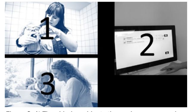
Figure 2: 1) The elderly residents themselves or a caregiver performs the brushing. Data are automatically registered and sent to the adherence aid systems database. 2) The Triage Citizen Overview tool – a wall-mounted touch-screen computer

unit – shows the current status of the brushing actions. 3) Caregivers, citizens, and/or relatives can jointly review historic brushing action statistics on a tablet or web client.