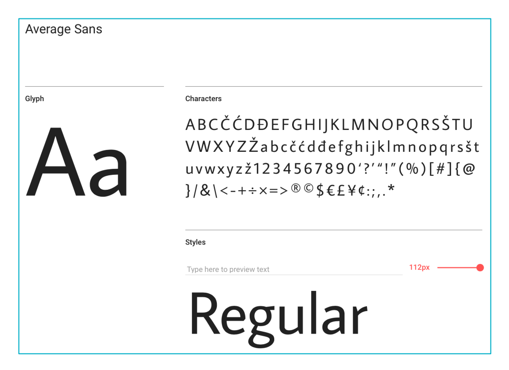
Figure 2: Font Average Sans