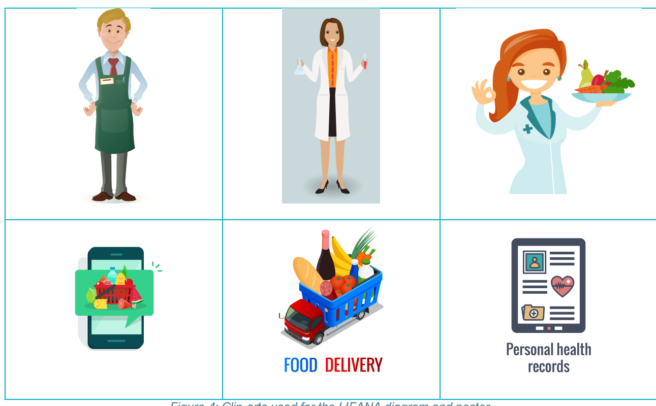
Figure 4: Clip-arts used for the LIFANA diagram and poster.