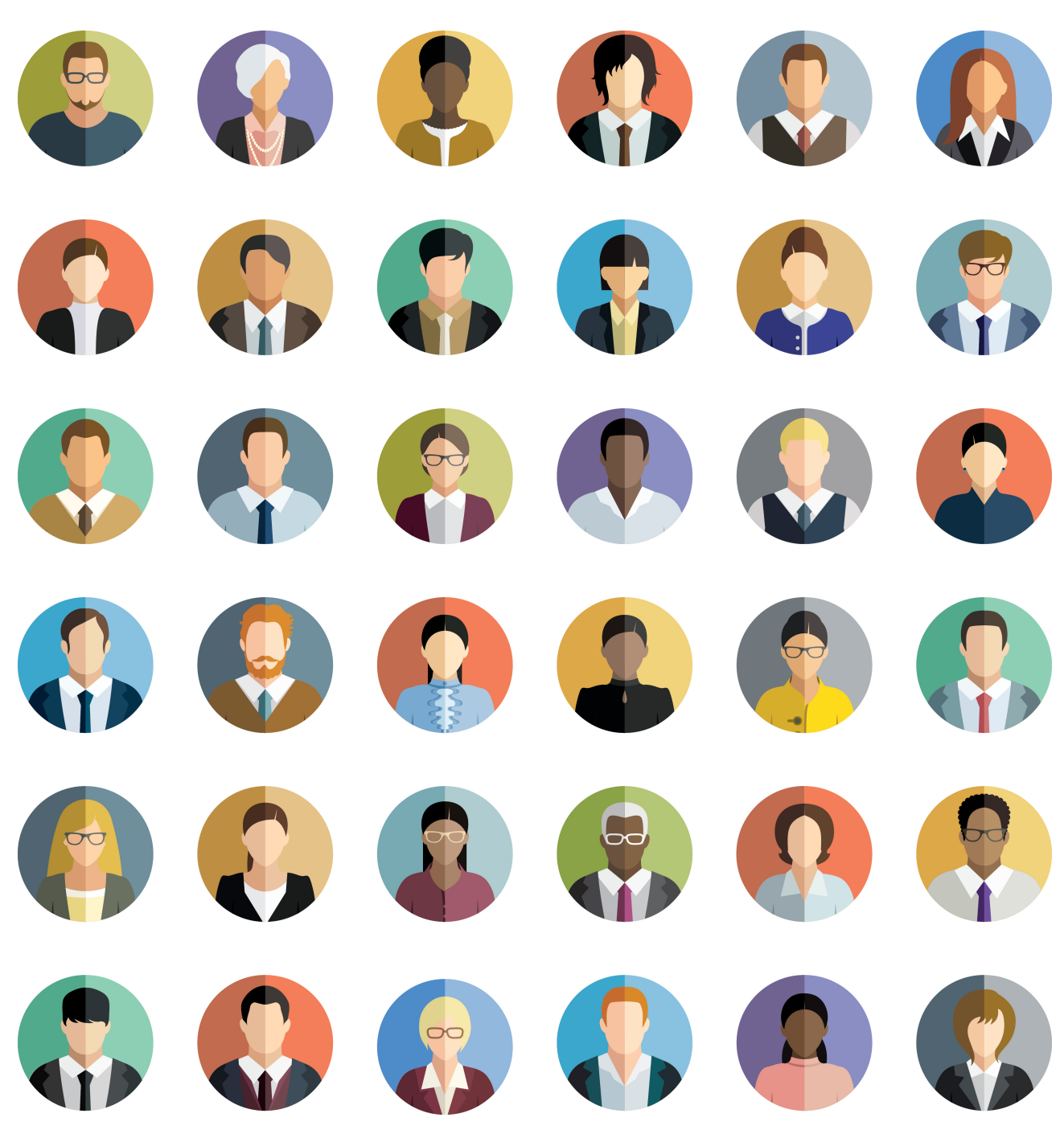
Figure 5: Set of avatar images, used to illustrate Personas.