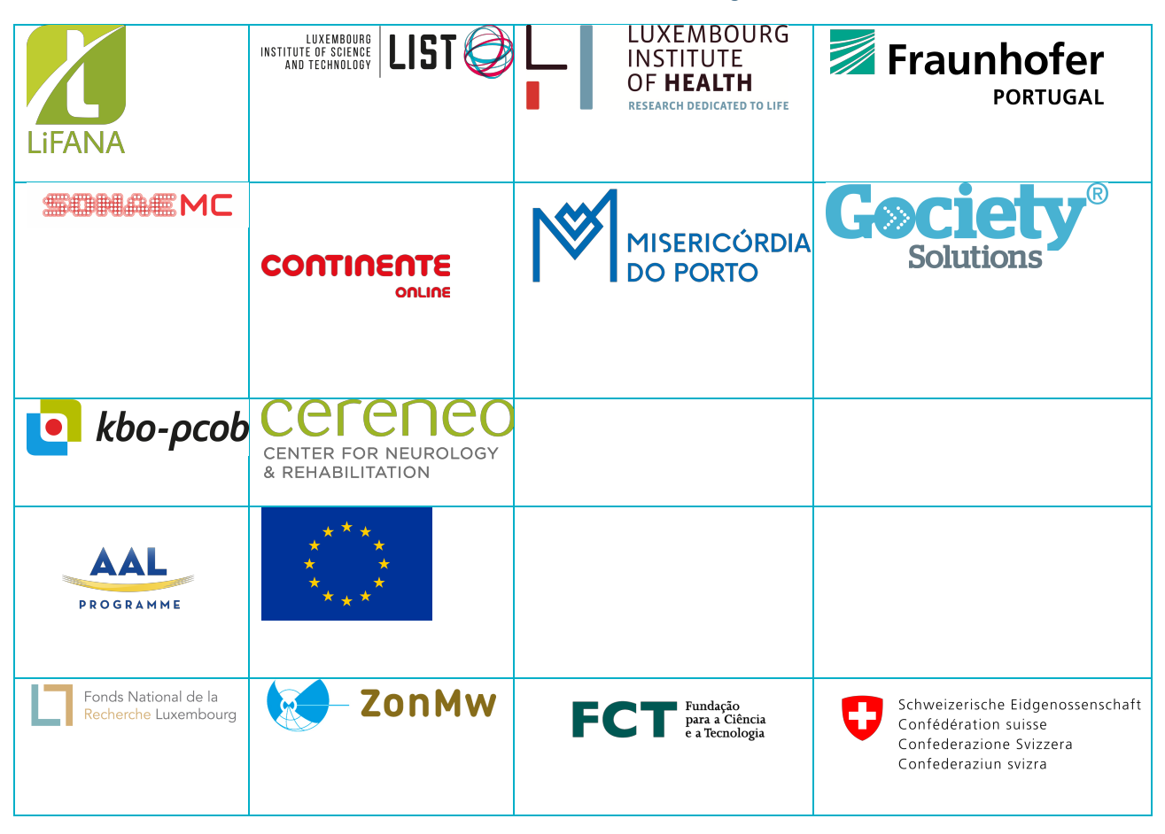
Table 2: Overview of all available logos.

The following Table 2 gives an overview of all logos.