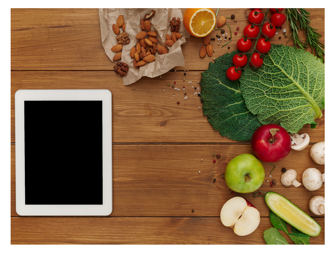
Figure 3: Generic kitchen background image, used for website and poster.